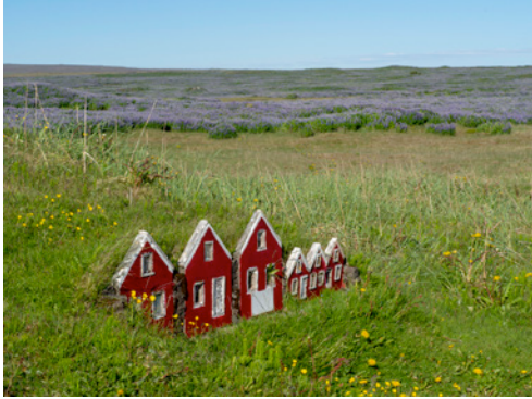
Iceland elves houses. They are meant for the Huldafólk.