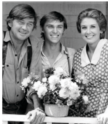
Actors Ralph Waite, Richard “John-Boy” Thomas and Michael Learned (ca. 1972) as the main characters of ABC’s The Waltons .

For those of us who enjoyed watching Richard Thomas as “John-Boy” on The Waltons TV series, it’s hard for us to grasp that Thomas is nearly 66 years old, a grandfather, and a spokesperson for, as well as the National Chairperson of, the Better Hearing Institute.